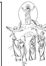
ASCENSION OF OUR LORD

www.cso.za.org or hodpastoralcare@stpaulus.co.za